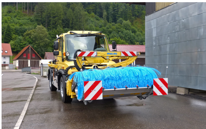
MFK 500-T in transport position