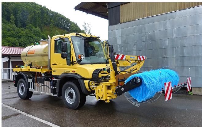
MFK 500-T in transport position